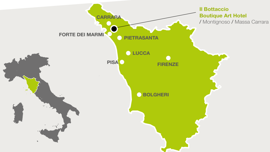
Il Bottaccio Boutique Art Hotel / Montignoso / Massa Carrara